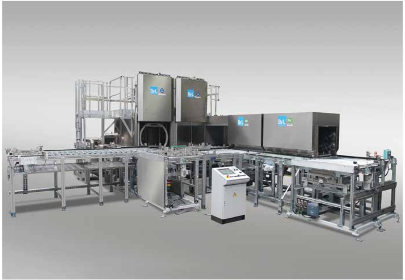
NiagaraDFS as double-chamber system, with Nevada vacuum drying, passive Arctic cooling tunnel, maintenance platform and continuous roller system for automatic component loading and unloading of the workpiece carriers