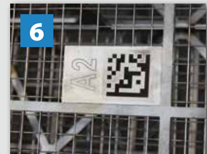
Detail Barcode scan + washing program storage