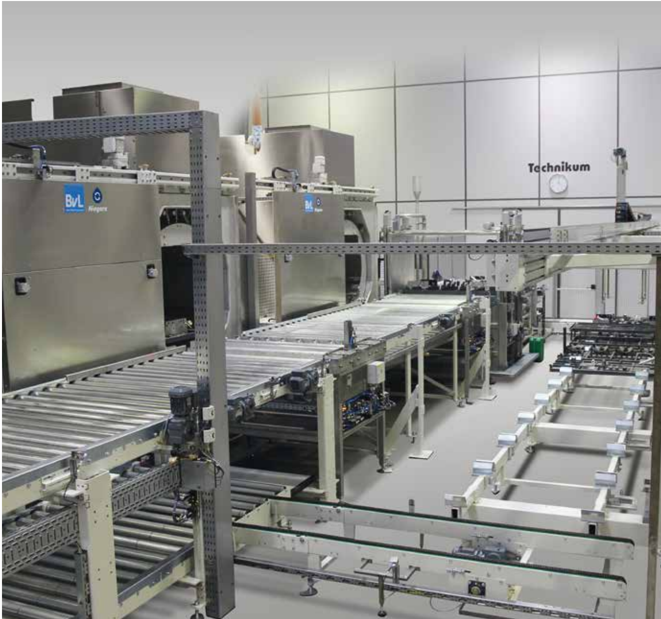
NiagaraDFS as double system with Nevada drying, roller conveyor, bridge loader and workpiece carrier station