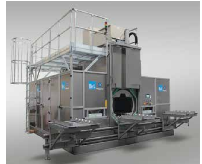
NiagaraDFS with triple cross-movement table, maintenance platform and complete housing.