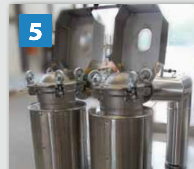
Detail Energy saving insulation package