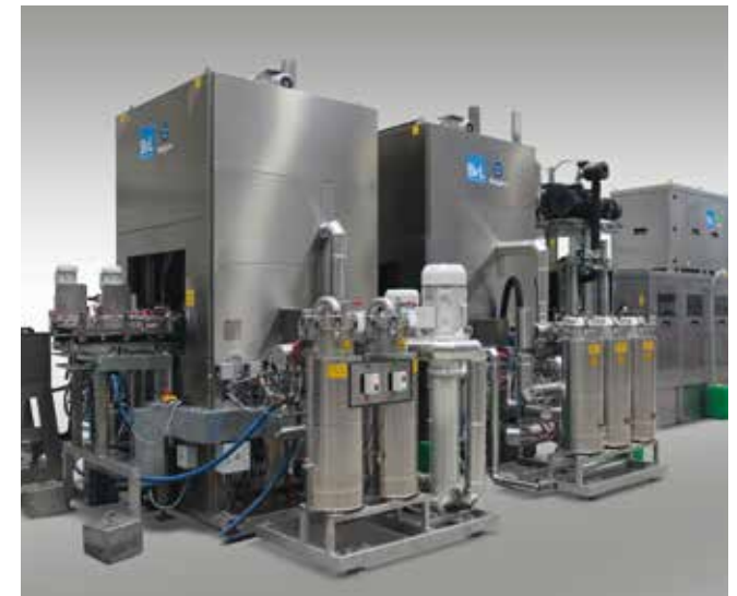
NiagaraDFS as double-chamber continuous system with downstream Nevada vacuum drying and active Arctic cooling tunnel