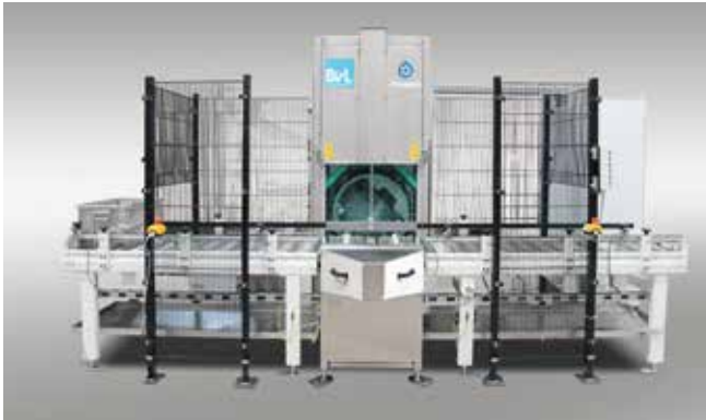
NiagaraDFS with automatic loading and unloading incl. basket buffer