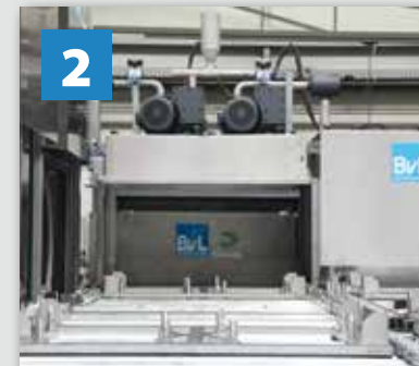
Detail External vacuum dryer