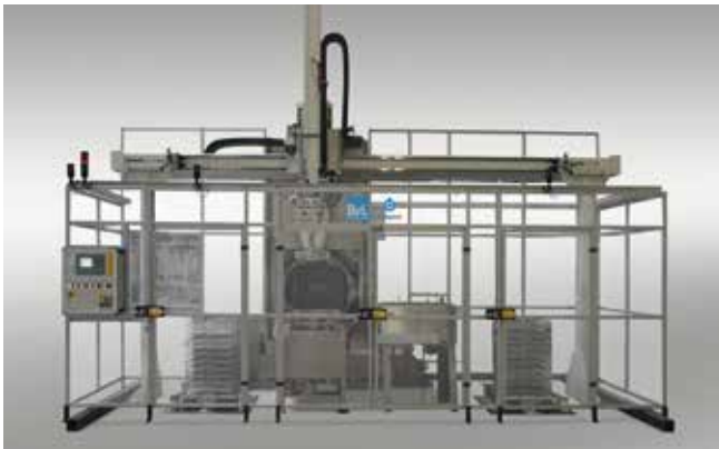
NiagaraDFS with double-cell bridge loader, incl. floor roller cleaning device