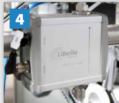
Detail Libelle for bath monitoring