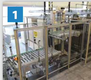
Detail Lifting/lowering station

Following the guiding principle of Smart Cleaning, we offer sensor technology for preventive maintenance based on real-time data. This allows you to achieve more efficient production planning as well as a longer service life and increased availability of the machines.