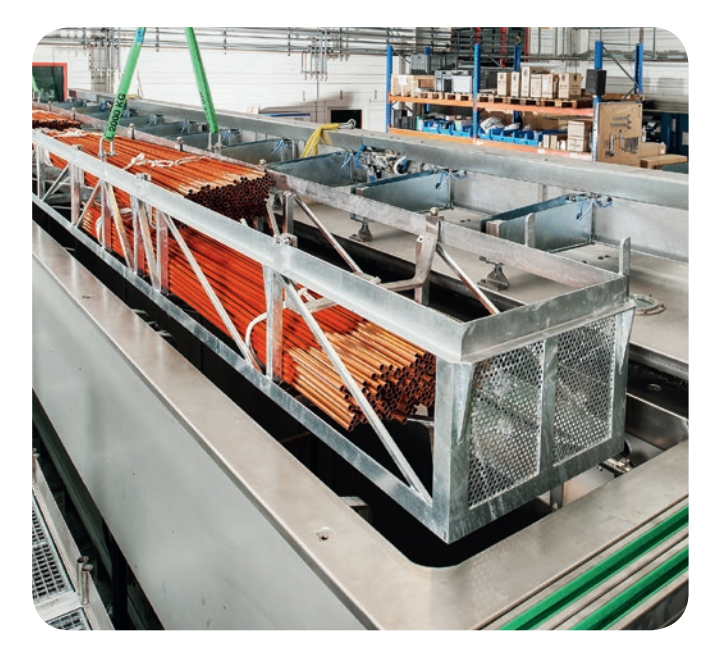
Cleaning of elongated copper tubes

The development and construction of special plants has always been our great passion. From the cleaning of tubes or agitators to optical components, everything is possible. We are always looking forward to new challenges.